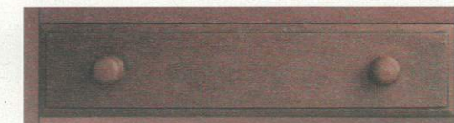
Primer Red with Dark Wax