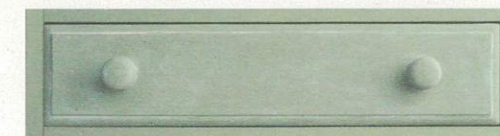
Coolabah Green with White Wax