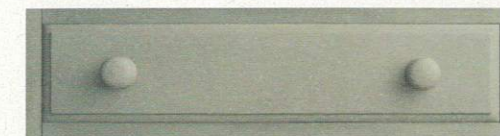
French Linen with Matt Lacquer