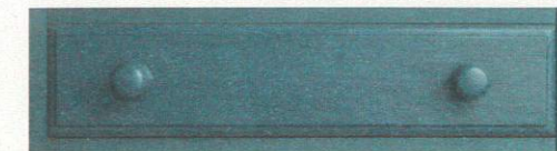
Aubusson Blue with Gloss Lacquer