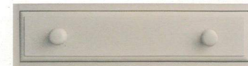
Antoinette with Clear Wax